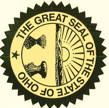
Jon Husted Lieutenant Governor